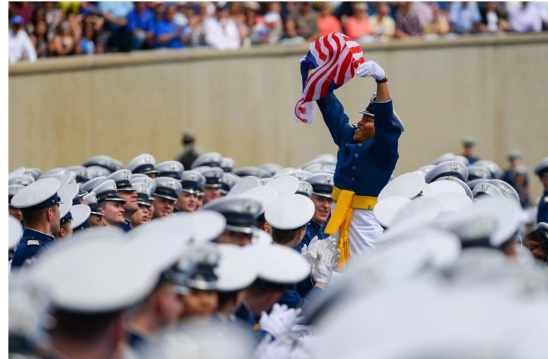
U.S. Air Force Academy