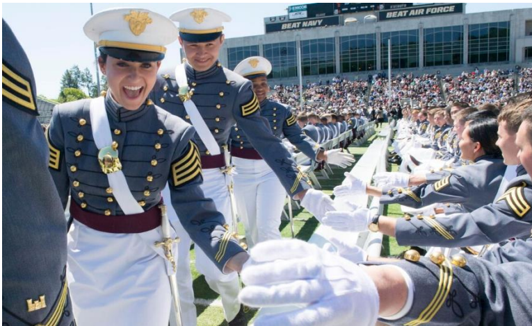
U.S. Military Academy West Point