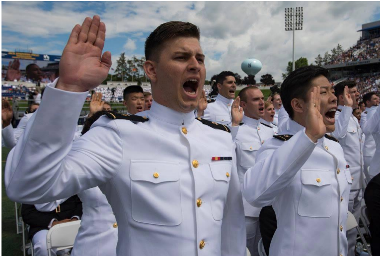
U.S. Naval Academy

Please note, the U.S. Coast Guard Academy does not require a Congressional Nomination