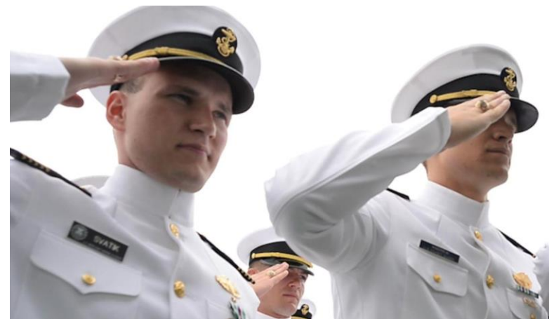
U.S. Merchant Marine Academy